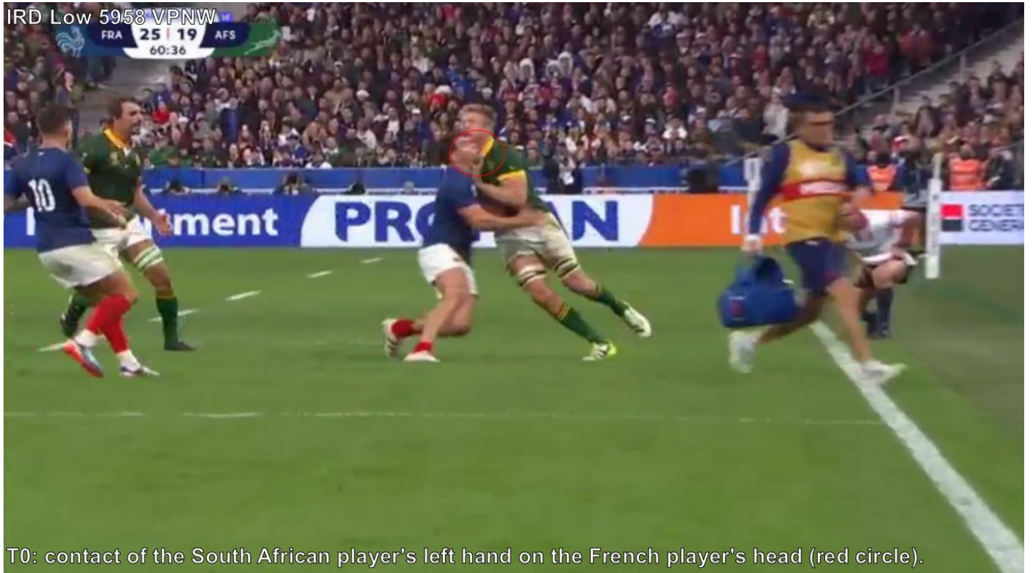
T0: contact of the South African player's left hand on the French player's head (red circle).

5958 IRD Low: Valid Penalty Not Whistled (VPNW)